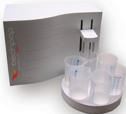
view of fibers using MorFi